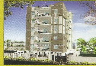
NAVYA GLASS EMERALD at Malakpet