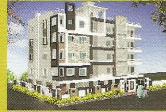
NCR NAVYA SAPPHIRE At Kondapur