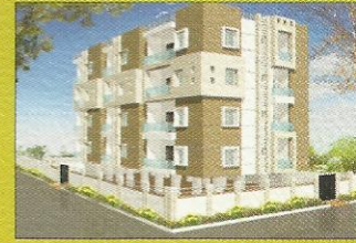
NAVYA SAI NIVAS At Kondapur